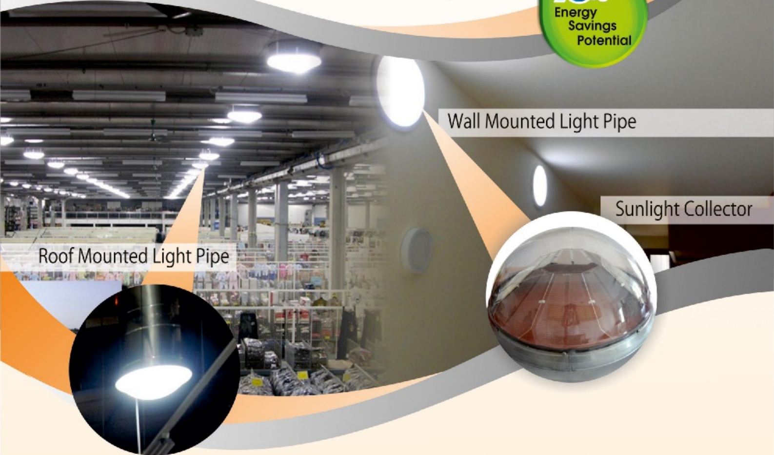
Roof Mounted Light Pipe