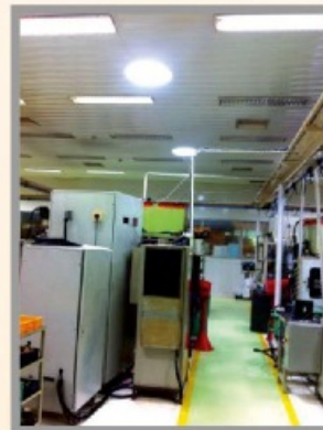
Daylighting Integration with Electrical lights

Natura Eco Energy Provides Complete solution to switch them off when Daylight is available.